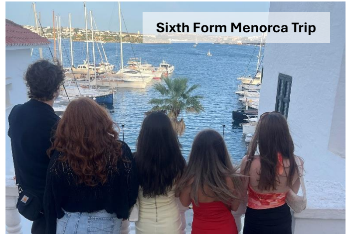
Sixth Form Menorca Trip

So, for those who have taken part in these exciting adventures and for those who have yet to set off on their travels, we look forward to seeing and hearing all about life beyond the walls of William Howard!