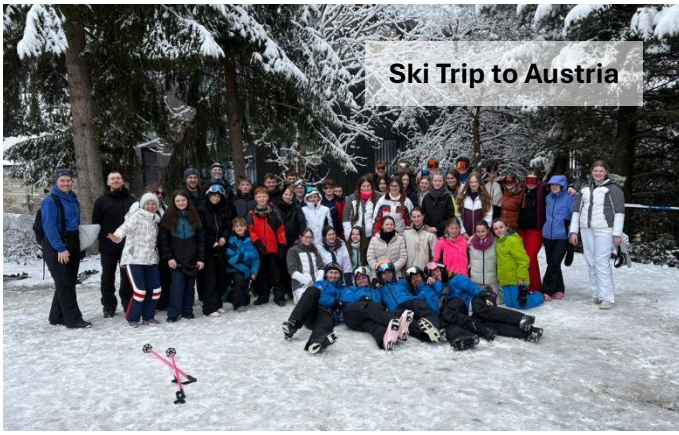
Ski Trip to Austria