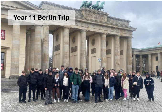
Year 11 Berlin Trip

Later this term we look forward to sharing the expected 2026-2027 residential and international trips list with parents and carers. This draft projection will give an insight into what is likely to be on offer in order to support forward planning.