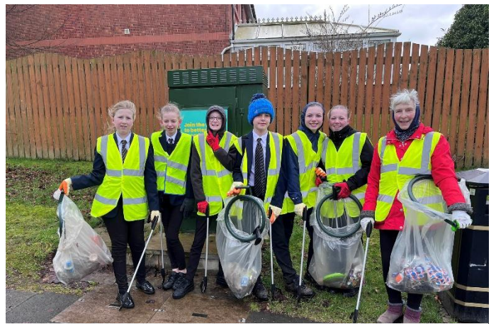
WHS's Eco Group recently joined forces with members of the Brampton Litter Picking Team for a community clean-up event.

We expect students to contribute positively to their local areas by being respectful of their surroundings and considerate of the people they encounter. This includes behaving appropriately in public spaces, being mindful of noise, disposing of litter responsibly, and representing the school in a way that reflects our shared values.