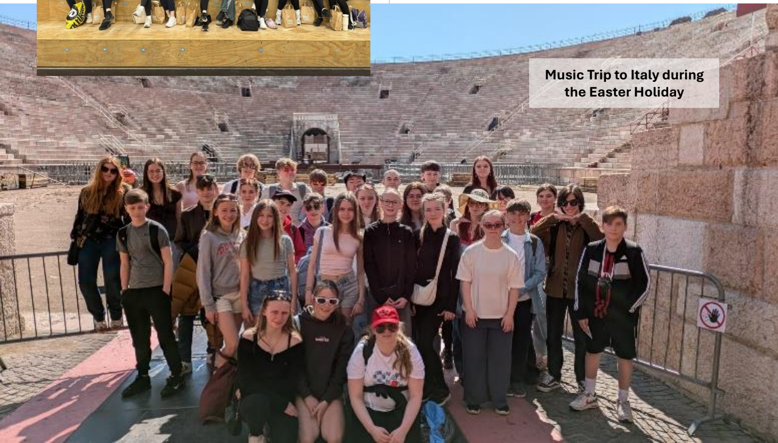
Music Trip to Italy during the Easter Holiday

Our wide array of residential opportunities is only made possible by our committed staff whose voluntary investment of time and passion in the planning and leadership of these events, is extremely valued. It is this exceptional discretionary effort from our staff that enables WHS to offer so many of these wonderful experiences to students of all ages. From Sports tours to Holland, Literary exploration in London, Music and Performance in the Italian Lakes, Geographical exploration in Yorkshire, Wales and Pompei, Outdoor Education in Snowdonia, Language Learning in Menorca and skiing in Austria... to name but a few, it is little wonder our pupils enjoy their learning and build such strong relationships.