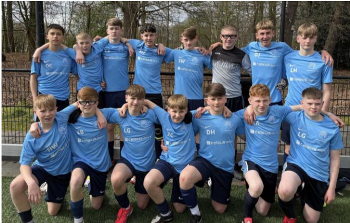
Sports Trip to Holland during Easter Break

The impact this has is immeasurable, from inspiring pupils to pursue personal ambitions, to developing character in environments that build resilience, spirit and compassion. Not to mention the wonderful memories that will shape students for a lifetime!