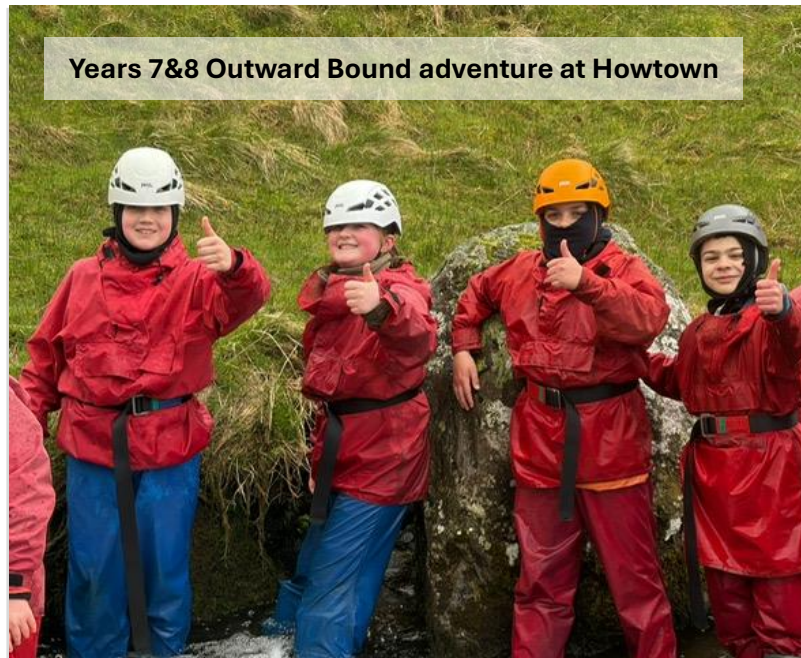
Years 7&8 Outward Bound adventure at Howtown

Our wide array of residential opportunities is only made possible by our committed staff whose voluntary investment of time and passion in the planning and leadership of these events, is extremely valued. It is this exceptional discretionary effort from our staff that enables WHS to offer so many of these wonderful experiences to students of all ages. From Sports tours to Holland, Literary exploration in London, Music and Performance in the Italian Lakes, Geographical exploration in Yorkshire, Wales and Pompei, Outdoor Education in Snowdonia, Language Learning in Menorca and skiing in Austria... to name but a few, it is little wonder our pupils enjoy their learning and build such strong relationships.